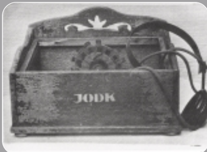
First Radio Service in Korea (1927)