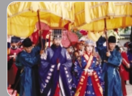
>Historical Epic_ Tears of the Dragon (1998)