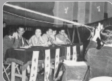
>Witty Talks (1961)